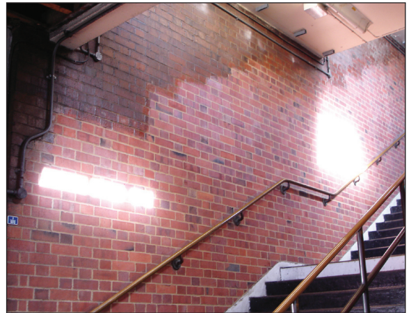
Upper area shows the old coating and the lower area has been cleaned & protected.

“As always with London Underground contracts the working times and conditions are a challenge. We only had a 3 hour working window each night and had to contend with a number of other trades for space and access. We tested three methods for removing the old anti-graffiti coating and agreed the most efficient and environmentally friendly with the client. The contract took 8 weeks and at times was extremely frustrating, but the end result exceeded the client’s expectations. It always gives me and my teams a sense of satisfaction to see the dramatic results on projects like this.”